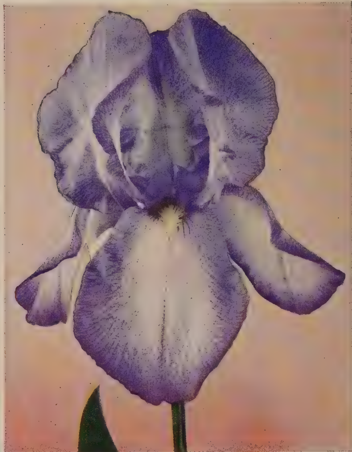
Blue Shimmer—$4.00 (Page 14)